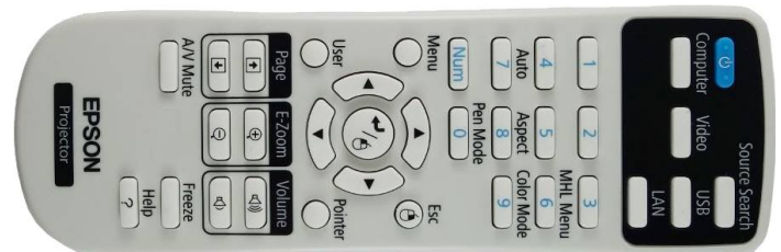
Smart Board Remote