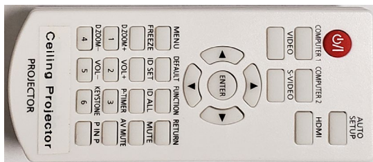
Ceiling Projector Remote