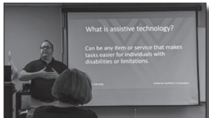
OLLI members learned about the Assistive Technology Library available through WVATS.

You can opt out of receiving our printed catalog. All classes and special events are listed on the OLLI registration site, and courses that are added after the catalog goes to print will be there as well. Members who opt out of the printed catalog will receive a PDF (electronic) copy of the catalog as soon as it is sent to the printer, even before it goes out in the mail.