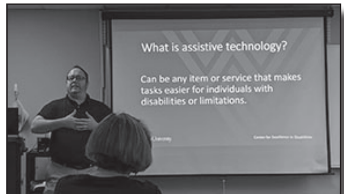
OLLI members learned about the Assistive Technology Library available through WVATS.

You can opt out of receiving our printed catalog. All classes and special events are listed on the OLLI registration site, and courses that are added after the catalog goes to print will be there as well. Members who opt out of the printed catalog will receive a PDF (electronic) copy of the catalog as soon as it is sent to the printer, even before it goes out in the mail.